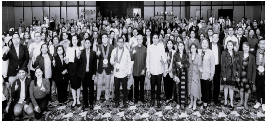
DOST Officials with Senator Miguel Zubiri and other dignitaries during the closing ceremony of the 2024 Philippine Textile Congress at Luxe Hotel, Cagayan de Oro.